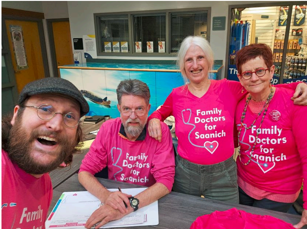
Family Doctors for Saanich volunteers tabling at Saanich Commonwealth Pool!

Following our campaign launch in mid-December, Family Doctors for Saanich has been hard at work. The past two weekends we've been tabling at Commonwealth Pool, and I've been out on the doorstep speaking with Saanich neighbours.