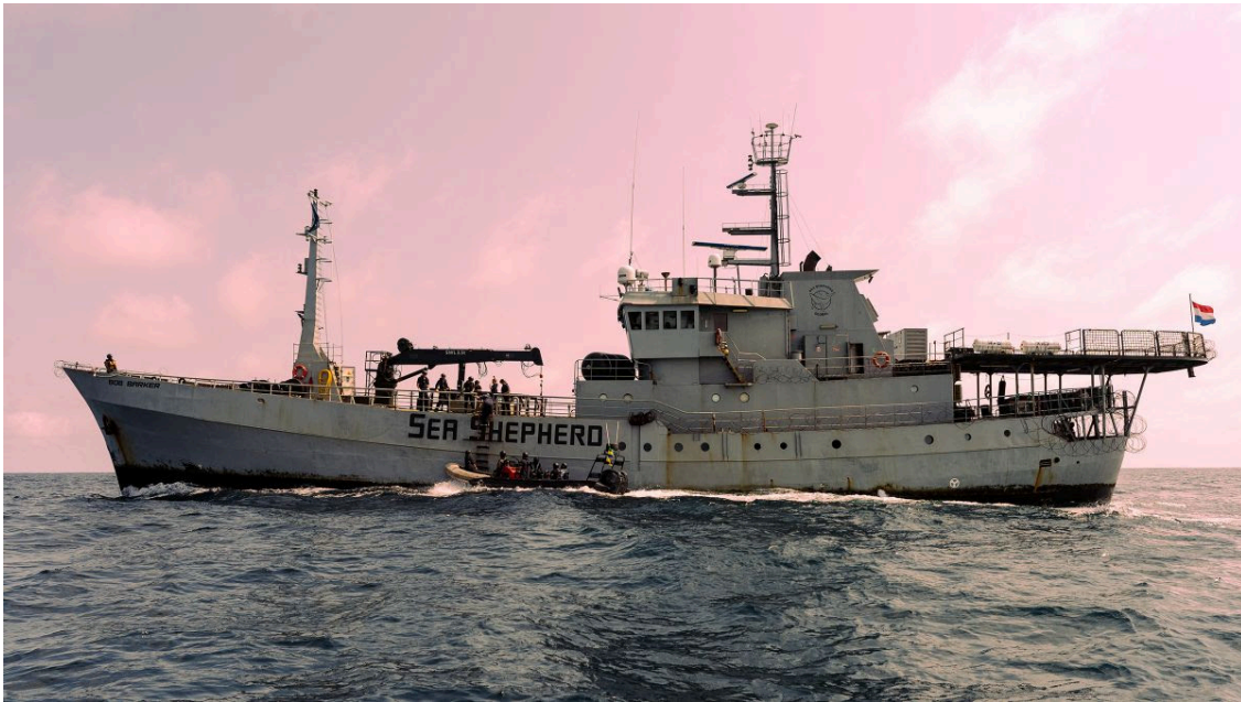
An inspection team returns to the Bob Barker, while she is on patrol off the coast of Gabon, in the Gulf of Guinea.