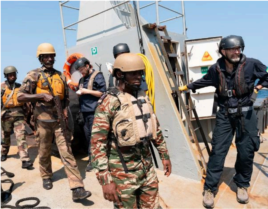
On board the Bob Barker, and preparing to depart on a inspection of a fishing vessel. A classic picture from the field, where I'm in the background taking notes.

As you may know, for the past several years, I have been part of an international research team studying the evolving strategy of Sea Shepherd. The project is housed at the Fridtjof Nansen Institute , and funded by the Research Council of Norway.