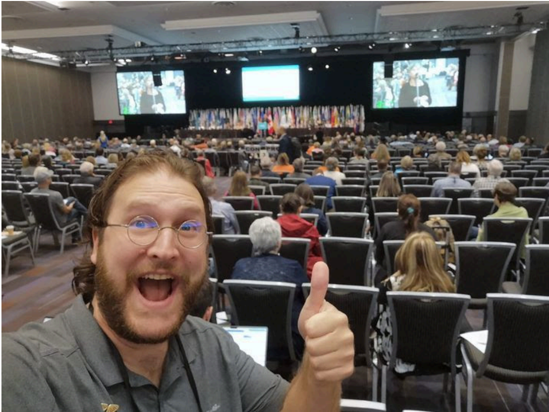
Celebrating at UBCM after delegates voted in favour of adopting New Westminster's resolution on means tested traffic fines.

It don't think it would be possible to summarize the full conference, so I will focus on resolutions. I was impressed, and a little surprised, that we managed to debate and vote on all 93 resolutions in the Resolution Book .