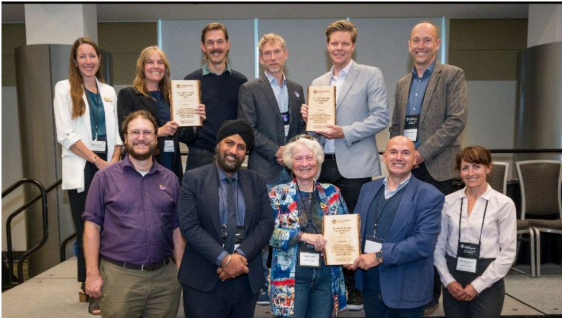
Saanich Council being awarded a Climate & Energy Action Award from the Community Energy Association for our Community E-bike Incentive Pilot Program

respond in due time. I'll be sure to keep people in the loop.