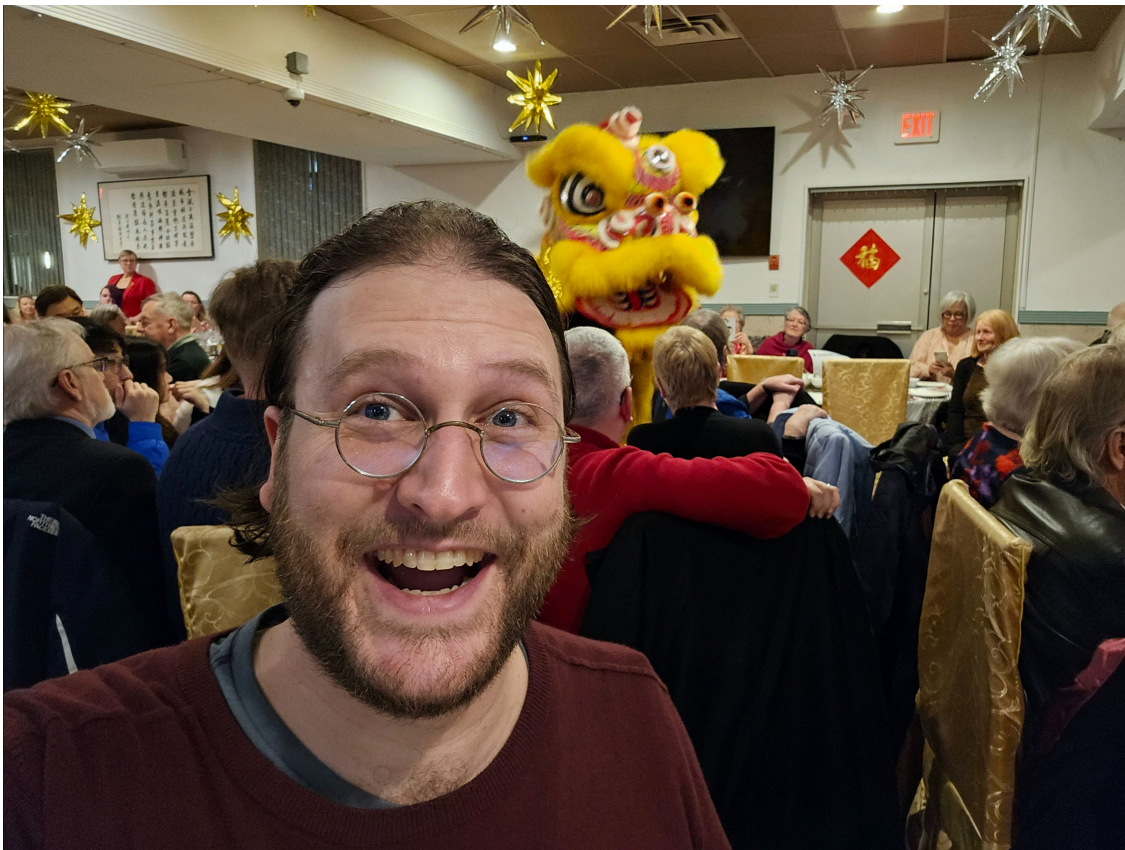
Attending the Victoria Chinatown Lioness Lions Club 'Light the Dragon Chinese New Year Dinner,' in my capacity as Acting Mayor.

This month, the 2023 Saanich Climate Plan Report Card was released. We have been making progress implementing our Climate Change Plan, but more is needed.