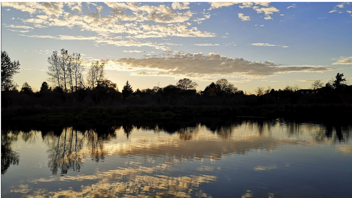
The sunset at Swan Lake. Watch a video from the boardwalk here .

Council recently approved a new townhouse project near Shelbourne.