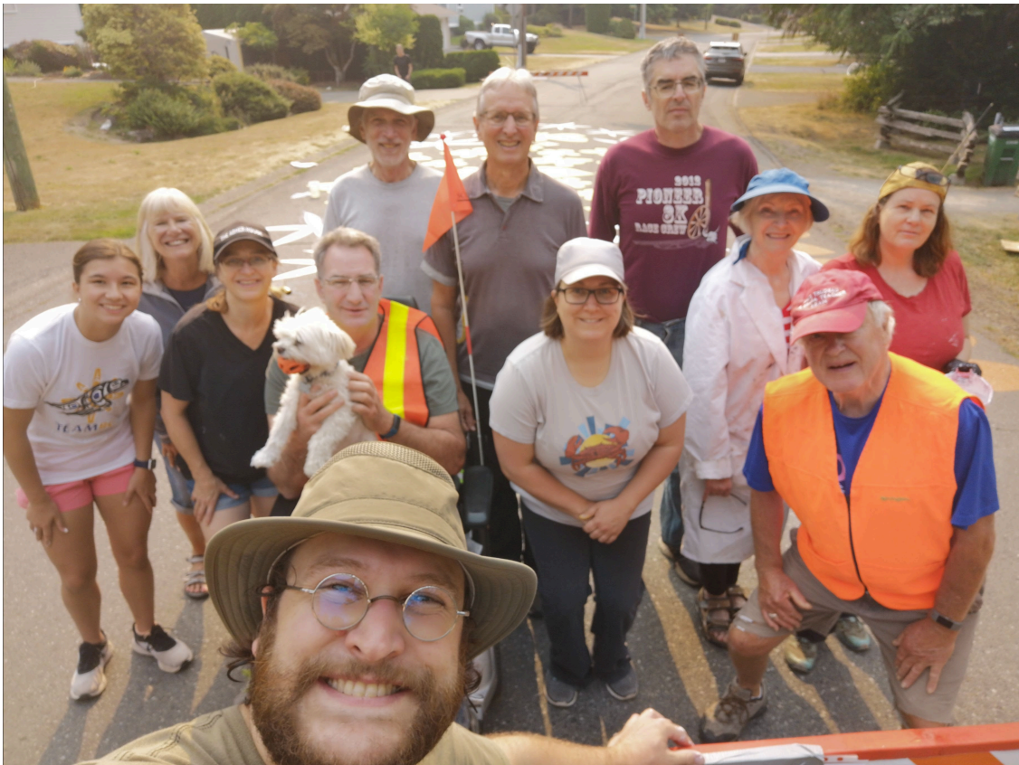
Some of the amazing volunteer team that helped make this project happen!

You can read news stories about the project from: Victoria Buzz , Radio Canada , and the Saanich News ,