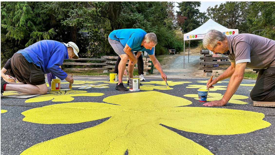
Volunteers repainting the Falaise Crescent Road Mural!