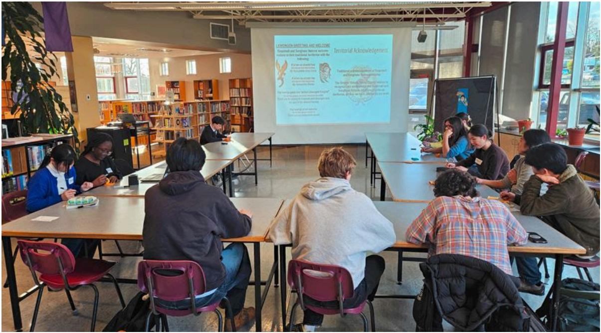
Saanich Youth Council gathered around a table hard at work.

Saanich Youth Council: I am so proud of the ongoing work of the Saanich Youth Council! As you know, for the past several months I have been working with local Saanich High Schools to set up and run a youth council. This group has been meeting monthly and I am so impressed with these amazing young people. This month they prioritized their issue of focus and will be turning their attention to transportation issues this spring.